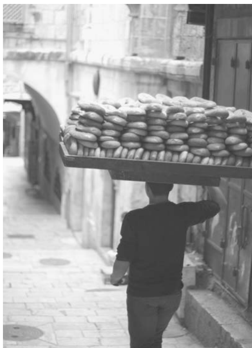
Seller of bread on Old Jerusalem street in Israel.

Almost all local dough is made with wheat flour. Perhaps the most common local bread is the indigenous pitta (pl. pittot), a small round soft pocket of leavened bread that can be conveniently filled. There is also a larger pitta, made by sticking rounds of thin dough to the side of the taboun, oven, which when crispy (Iraqi) or thick (Yemenite) can be torn up and eaten, dipped into humus , chickpea salad; or a softer, thinner version, known as a laffa, which can be wrapped around a filling. Tunisian Jews brought French baguettes for their “Tunisian sandwiches,” Moroccans brought frena, elongated flatbreads, sometimes dimpled, flavored with olive oil and ketzah (nigella seeds), and baked on hot pebbles. Ordinary pittot, often sold from the open front of the bakery, are also sometimes spread with olive oil and za‘atar, powdered hyssop; with tomato sauce with or without yellow cheese; and with chopped onions. Yemenite Jews brought a number of their own dough foods and breads: salouf , an elongated flatbread similar to Moroccan frena but made on a grill; jahnoun , a yeast and oil dough cooked as a roll and eaten chopped up with pulverized fresh tomato sauce; kubaneh , yeast dough with samneh, clarified butter, or margarine, baked slowly in